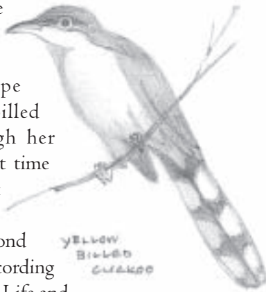
YELLOW BILLED CUCKOO