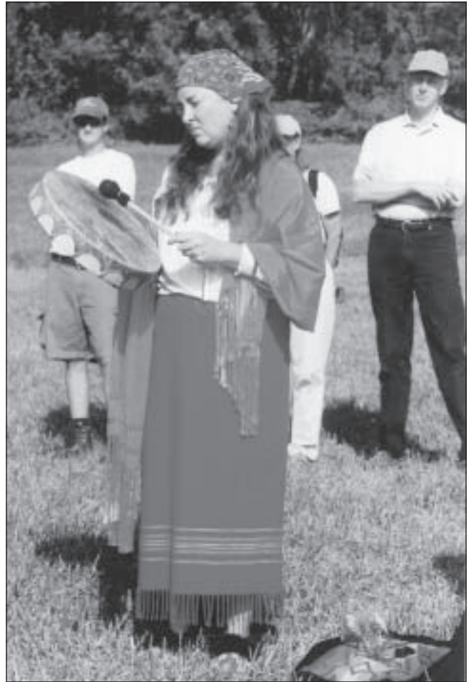
Blessing the land at Okehocking Preserve Opening Day.

The Okehocking Preserve is located between Delchester and Garret Mill Roads on the north side of West Chester Pike. It includes 136 acres of rolling hills, wetlands, native grasslands and woodlands and has a 3200 foot stretch of the Ridley Creek meandering through it. There are several loop trails through the Preserve, ranging from a brief walk to a good hike of up to one hour. There is an area along Delchester Road where dogs are permitted off leash. Dogs must be on leash in the rest of the Preserve. The Preserve is open for all to enjoy during daylight hours.