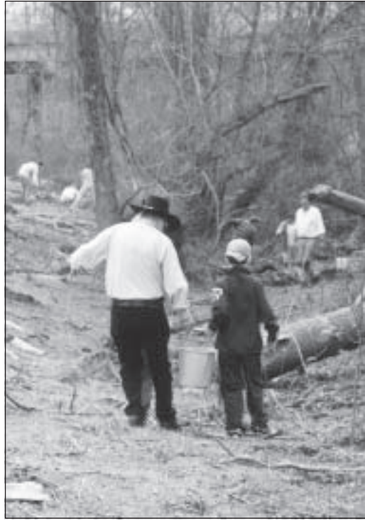
Working hand in hand to plant trees along the Ridley Creek.

The Trust, along with many partners, is taking responsibility as a steward of these watersheds by working to protect and improve water quality and supply, to create wildlife corridors and open space networks, to further protect historic and scenic resources, and to establish expanded trail networks and other recreational opportunities for public benefit.