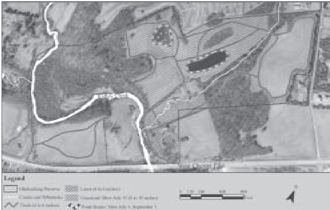
A GIS generated map for the Okebocking Preserve management plan showing the mowing schedule on top of an aerial photo.

Thanks to a generous grant from the Pennsylvania Land Trust Matching Grants Program, we have begun to develop our Geographic Information Systems (GIS) capacity. GIS is a computer-based mapping tool that will be very useful in our land protection efforts. GIS organizes geographical data and provides the capability to visualize the data through maps. These maps can overlay different data layers, including parcels, soils, water resources, and aerial photos.