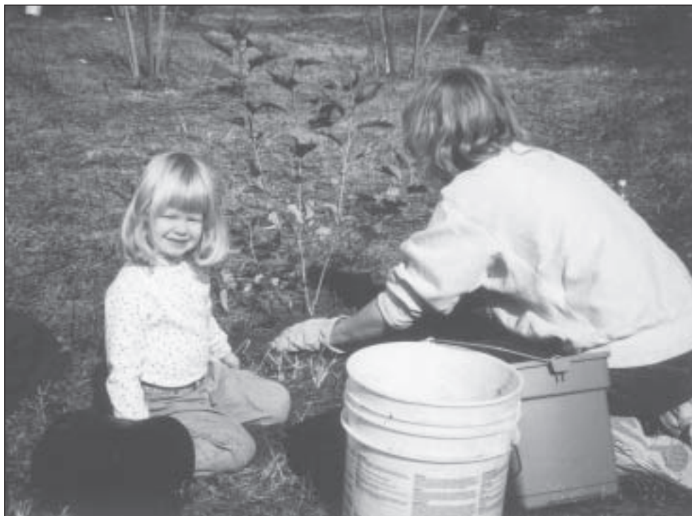
Look what we’re doing at Trader’s Run. This is really fun!