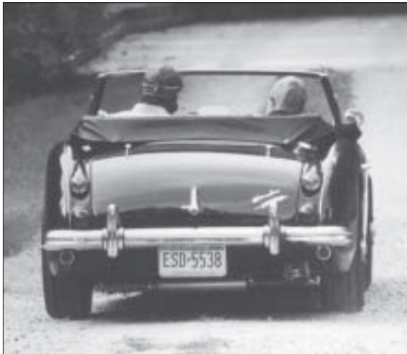
...to return several hours later.

Saturday evening we all had dinner at Radnor Hunt overlooking the countryside with a few magnificent antique cars in the foreground. It was especially satisfying to know that the Radnor Hunt view has been permanently protected by a conservation easement donated in 1990 by all the members and will be enjoyed forever in its natural state. Early on Sunday we arrived to find over one hundred extraordinary vehicles on the Radnor Hunt grounds with owners awaiting the decision of the judges.